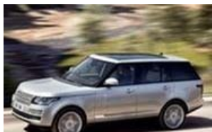
Here Are the 5 Top Luxury SUVs of 2013 Mainstreet