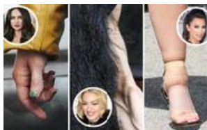
Hollywood's Worst Body Parts SheFinds