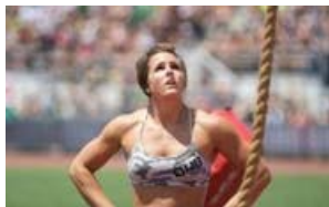
11 Drinks that are Destroying Your Health Shape Magazine