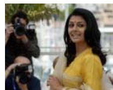
campaign, Nandita Das, has called out India's

On Friday, we learned of another case, this time at Macy's. Rob Brown, star of the HBO hit show 'Treme,' stated that in June he was paraded through Macy's Herald Square in handcuffs and placed in a holding cell because an employee suspected that his credit card didn't belong to him. He has since filed a lawsuit.