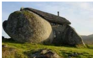
World's 7 Most Creative (and a Bit Frightening) House Designs HouseLogic