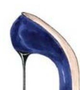
Behind the World's Most Iconic Pump: The Manolo Blahnik BB Neiman Marcus Blog