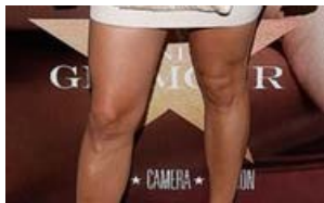
Hottest Celebrity Legs People