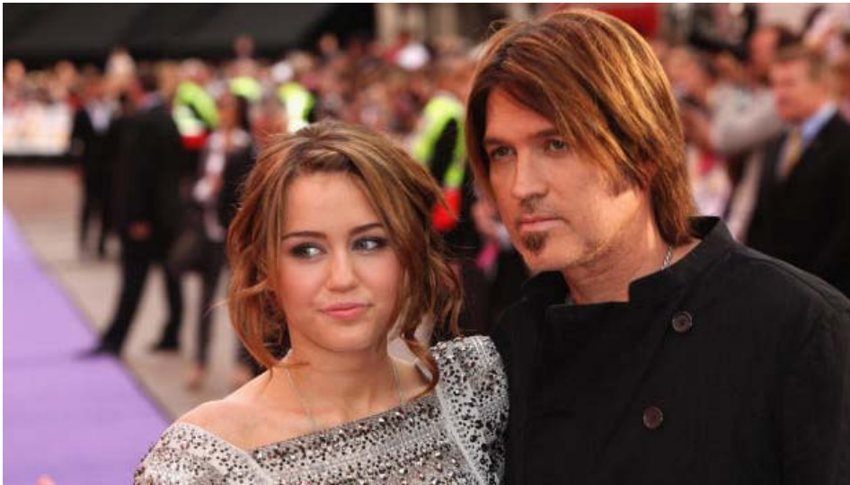
Miley Cyrus and father, Billy Ray Cyrus, arrive at the U.K. premiere of "Hannah Montana: The Movie" held at the Odeon, Leicester Square on April 23, 2009, in London.

7 Comments / 20 Shares / 4 Tweets / Stumble / Email More +